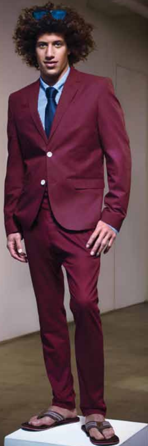
Photographed at Bertrand Delacroix Gallery, NYC.